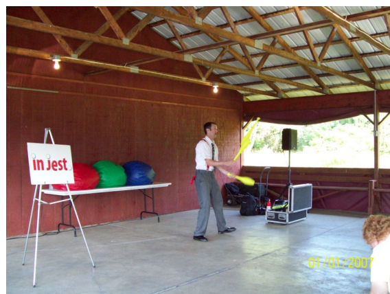
In Jest performance