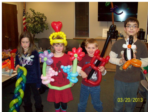
Balloon workshop with Gravitational Bull

Phone: 716-337-3211 Fax: 716-337-0647 E-mail: nco@buffalolib.org