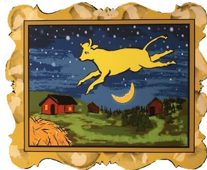
The Cow Jumping Over the Moon