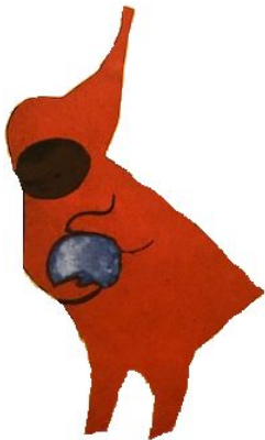
Peter from "The Snowy Day"