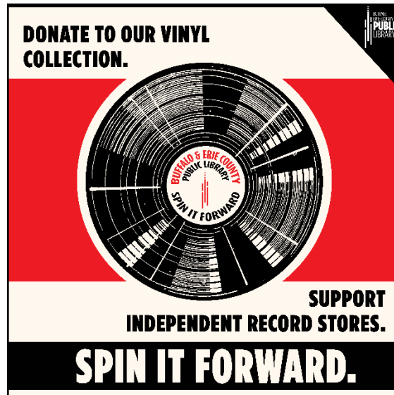
Image – LP vinyl record graphic indicating “Donate to Our Vinyl Collection” and “Support Independent Record Stores.” This is part of the “Spin It Forward” initiative

On August 5, and ahead of National Vinyl Record Day (8/12), Buffalo & Erie County Public Library launched Spin It Forward – an ongoing campaign announcing the first donation drive for vinyl records since 1989.