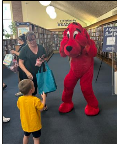
Photo – Clifford the Big Red Dog mascot with library patrons