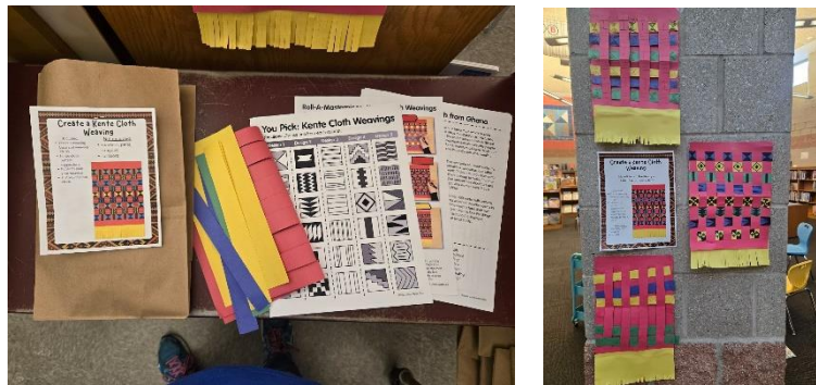
Photos – Various examples of the Kente Cloth weaving take n’ make

Frank E. Merriweather, Jr. Branch Library take n’ make craft celebrating the history of Kente Cloth weaving