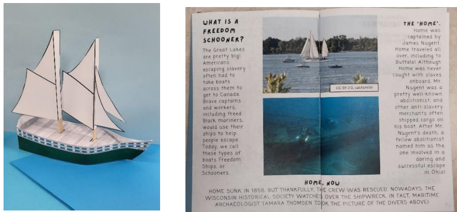
Photos – Great Lakes ‘Freedom Ships’ craft with a hand-out providing further explanation