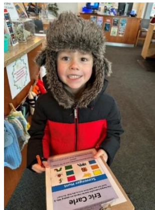
Photos - Children enjoying Take Your Child to the Library Day . The child on the right is holding the Eric Carle themed scavenger hunt activity sheet