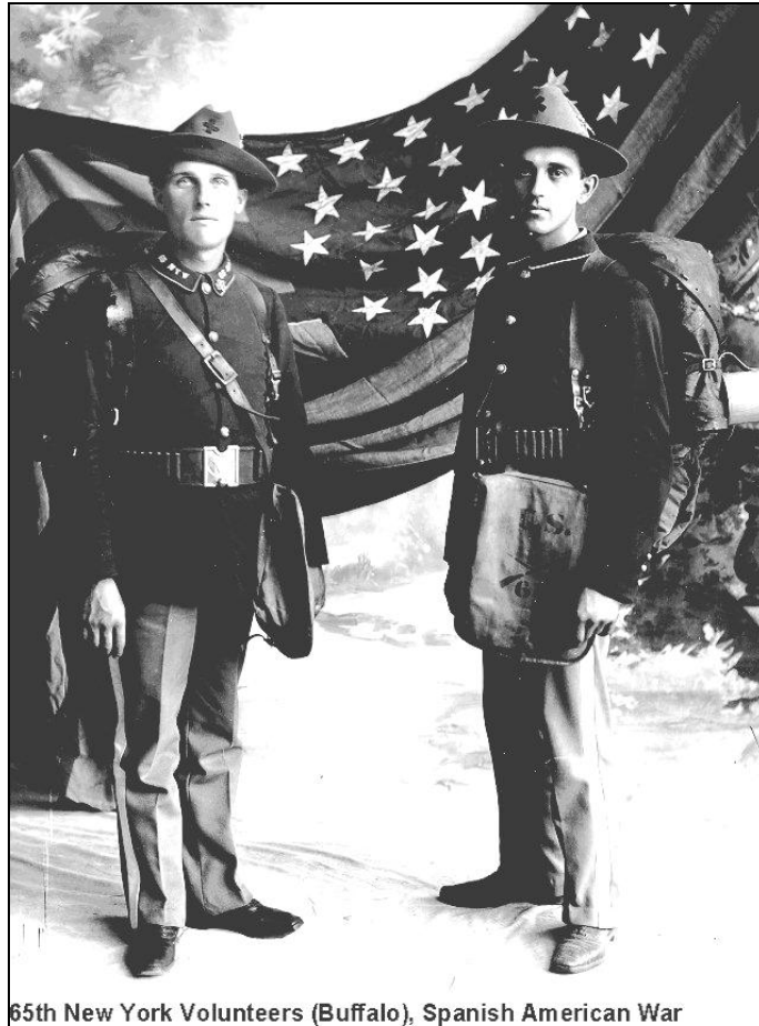
65th New York Volunteers (Buffalo), Spanish American War