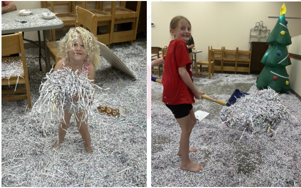
Christmas in July!

The Village of Angola provides the building for the library as well as the maintenance of the building. The County of Erie and the State of New York provide the main operating budget for the library. The Town of Evans provides additional funds for building maintenance.