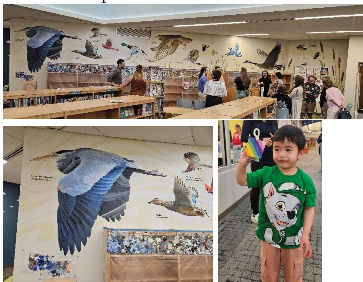
Images: Wall mural of various painted birds and a child holding a birdhouse