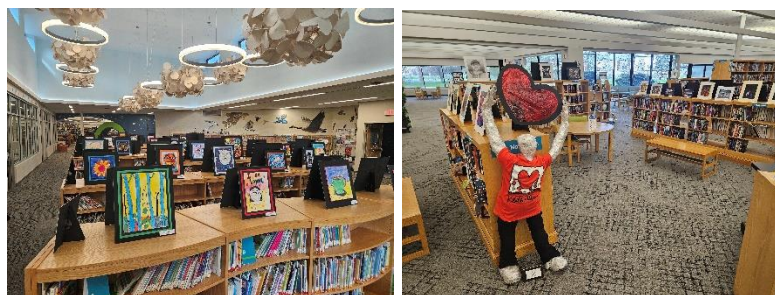
Images: Various artwork atop bookshelves in library