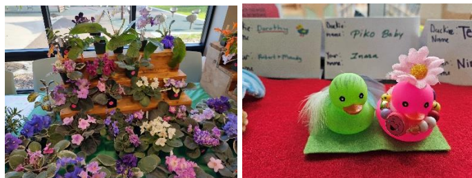
Images: African violets and decorated rubber duckies