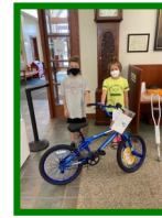
Bike Raffle Winners