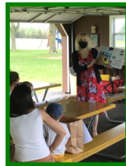
Story Time in the Park