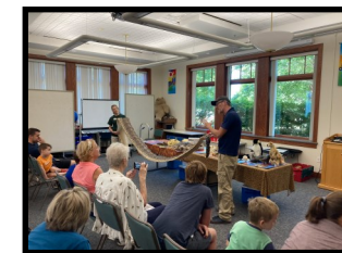
Visit from the Buffalo Zoo