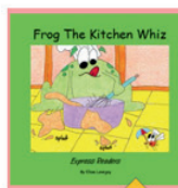
Step 6 (silent letters)