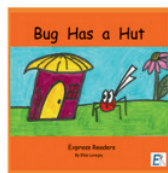
Step 1 (CVC Words)