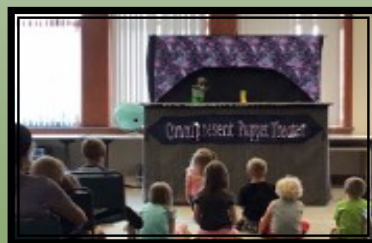
Omni-present Puppet Theatre Program Summer 2019

Over the past year, the Clarence Public Library has had a over 550 programs with an attendance of 11,397 people!