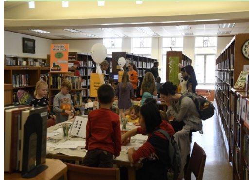
1st Annual Trick-Or-Read