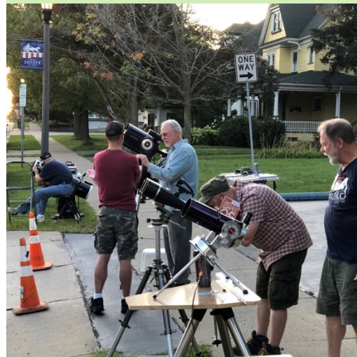
Astronomy Night @ the Library