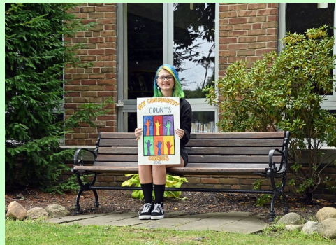
2020 Census My Community Counts Poster Contest Winner