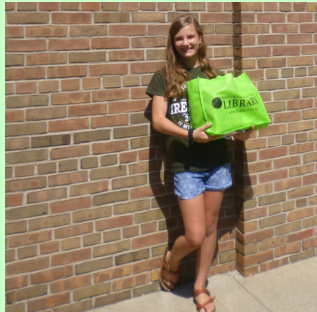
Winner of Family Summer Fun Pack