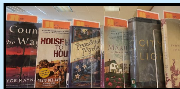
Get Reading Recommendations Through Staff Selections & Paton Picks