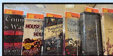
Get Reading Recommendations Through Staff Selections & Paton Picks