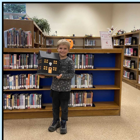
Haunted House Raffle Winner