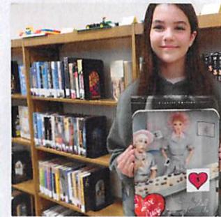
National Humor Month

MON 10 a.m.-8 p.m. TUES 10 a.m.-8 p.m. WED 10 a.m.-6 p.m. FRI 10 a.m.-5 p.m. SAT 10 a.m.-3 p.m. SUN Closed