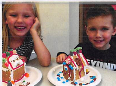
Graham Cracker Houses