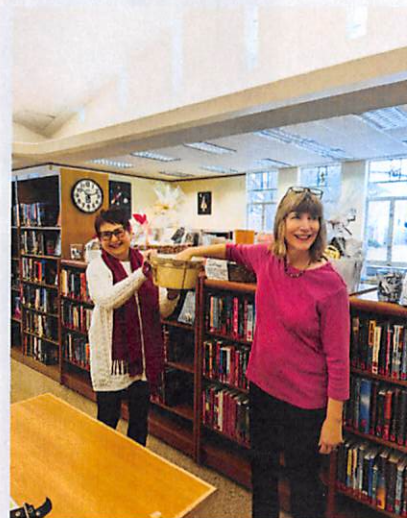
Friends Holiday Gift Basket Raffle