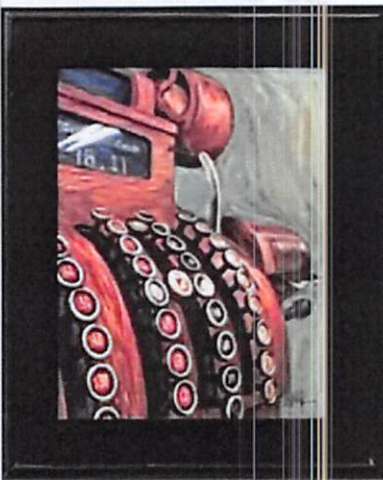
Local artist Linda Hall has a painting on display at the Aurora Town Public Library of an antique cash register. Hall's work is part of the Holland Tuesday Painter's Art Show.

The Holland Tuesday Painters have an art exhibit at the Aurora Town Public Library, located at 550 Main Street in East Aurora, from Nov. 13 through Dec. 29. The show includes studio and plein-air work in a variety of media including acrylic, colored pencil, digital photography and oil. Framed pieces will be displayed in the library's community room and small framed works are in the showcase in the foyer.