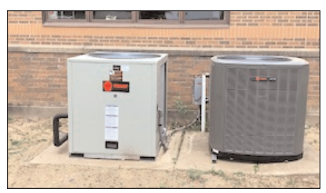
Not pretty, but so appreciated! Our new air conditioning units were installed through a NYS Library Constuction grant.