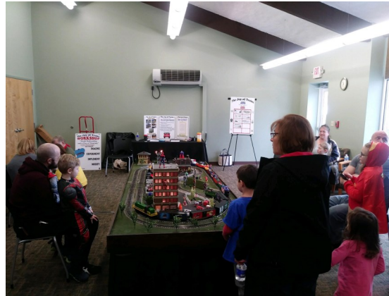
Families enjoy Take Your Child to the Library Day with the "Joy of Trains"