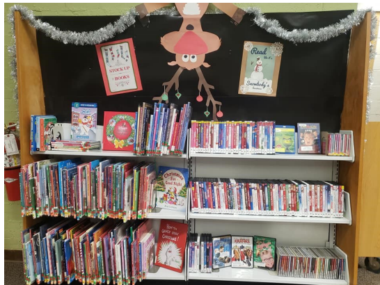
Cheerful Book Display for the Holidays