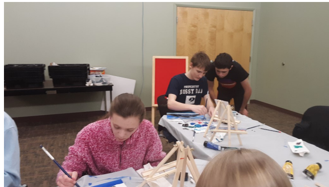
Teen Painting Party