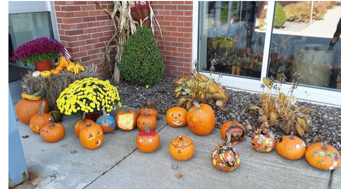
Jack-O-Lanterns decorated by the children of Elma displayed at our front entrance