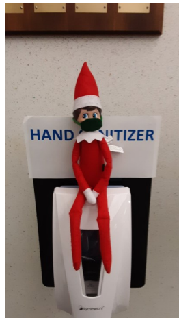
Elliot the Elf visiting the Library during the month of December