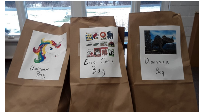
Themed Grab Bags of Books ready for Curbside Pickup