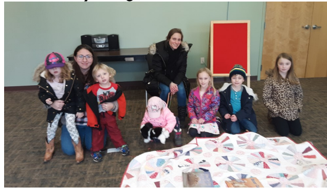
Kids participate in our annual Stuffed Animal Sleepover