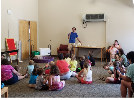
Turtle Encounter with the Niagara Aquarium