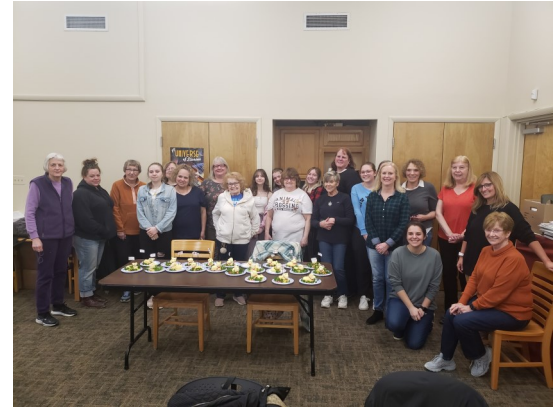
Elma Library patrons make butter lambs for Easter!