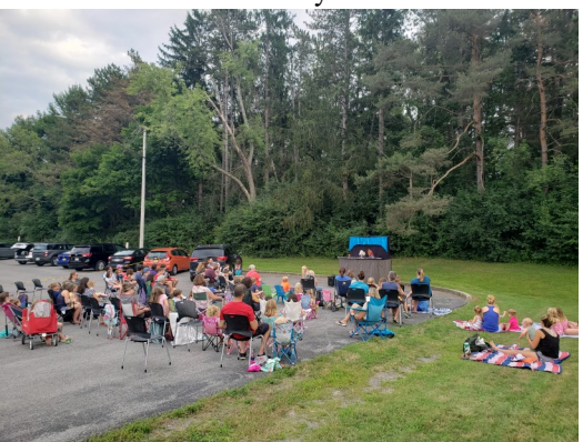
"The Little Mermaid" presented by the Omnipresent Puppet Theater