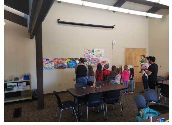
Budding artists view their work, with credit to the Albright Knox Art Truck Program