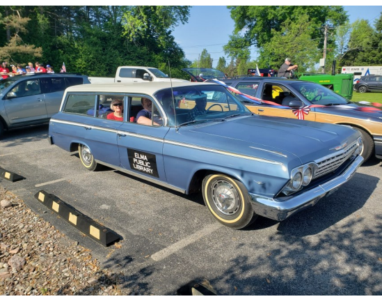
Library Trustees representing the Elma Library at the Memorial Day Parade!