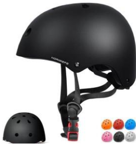
Kids Bike Helmet - $24 (Walmart)