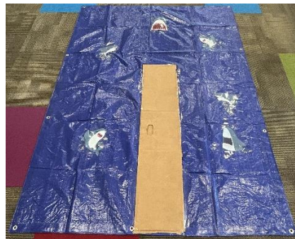
"Walk the Plank"