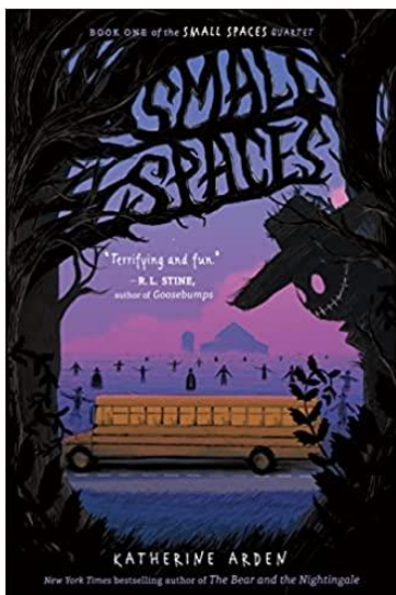
Small Spaces by Katherine Arden