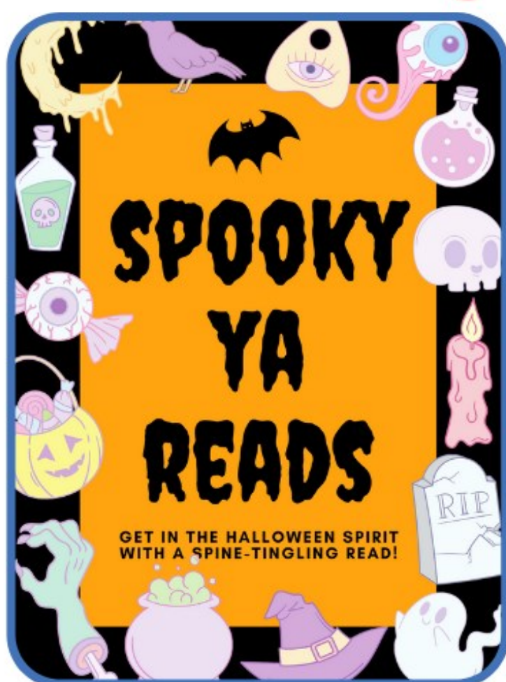
The new YA display!

Stop in to the library to check out which books we've featured and take one home (to read with the lights on!).