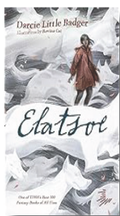
Elatsoe by Darcie Little Badger