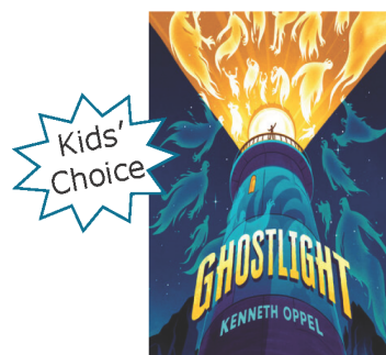
Ghostlight by Kenneth Oppel